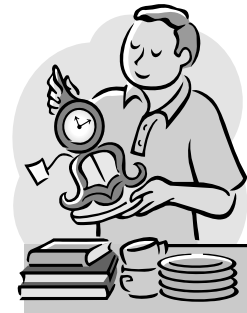
It's that time of year again. Time to look for bargains to help the kitties.

If you like a good bargain and you also want to help cats in need, you can't beat the B and O garage sale. Come out and support us while you browse at Steam Threshers. You're certain to find something you just can't live without. The kitties will thank you and so will we.