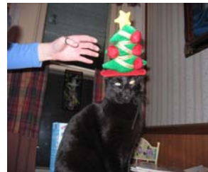
Butler is forced to wear a Christmas tree hat to look festive for the holidays.

The holiday season is also a stressful time to introduce a new family member into your home—and that is what a pet is—a new family member who will share your life for years to come. People