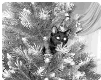
Butler, the angel at the top of our Christmas Tree.