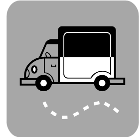
The savvy calicos at Crager Brothers Trucking know to stay out of the way of the trucks.